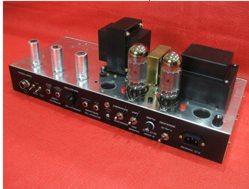
50W Overtone Special