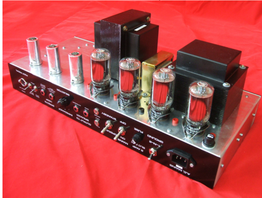
100W Overtone Special