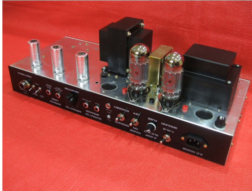
50W Overtone Special